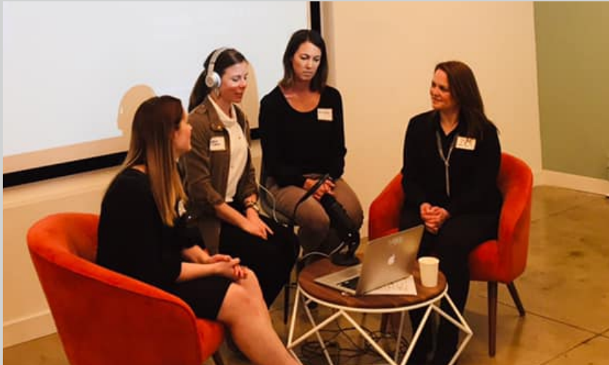
RD Real Talk podcast recording at the Weight Inclusive Nutrition and Dietetics (WIND) Conference; photo courtesy of Heather Caplan, RDN