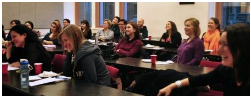
A lively and inquisitive atmosphere at the fall Roundtable Research Forum.

This past year, the student-run TESOL/AL Roundtable organization made a few key changes that enabled a marked increase in overall participation and allowed the group to explore new directions. Eight officer positions were added, which created leadership opportunities and made it (continued on page 9)