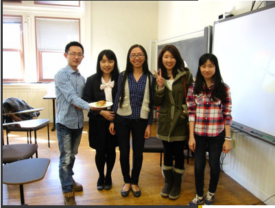
A snapshot of a research forum

“We are glad that the Roundtable has fulfilled two important purposes: to build a sense of community within our department, and to provide a much needed platform for students to share their work with peers and practice the craft of conference presenting.”