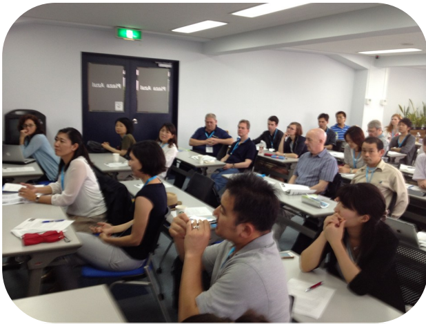
At the TCCUAAJ and JALT TED SIG sponsored Teacher Journeys Conference