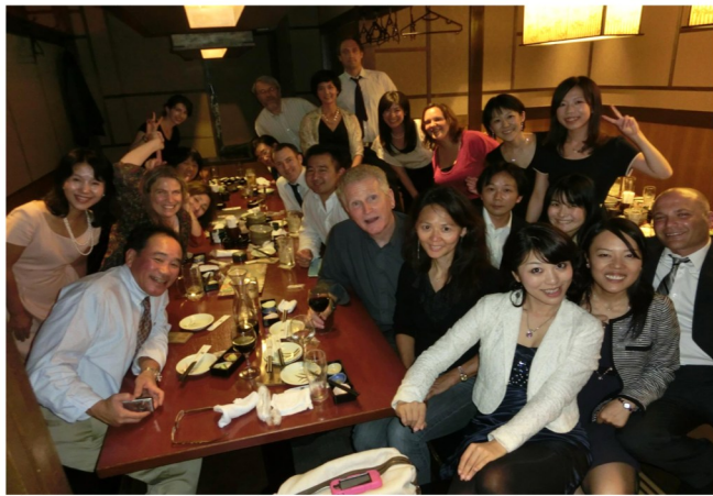
TC Japan students, alumni, and faculty celebrating after graduation ceremonies in October 2012