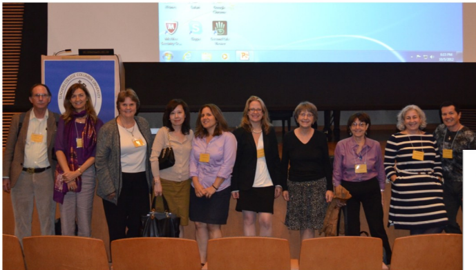
Speakers of the Symposium — world-renowned researchers in the field of second language acquisition

“[Interlanguage] holds deep implications for pedagogy and learning in a pluralistic education system.