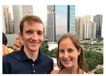
[ CHICAGO, ILLINOIS ]