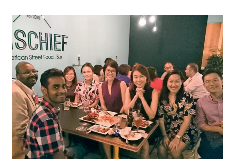
[ SINGAPORE ]